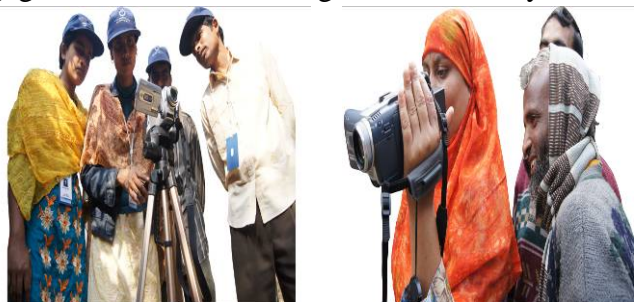
Figure 2. A practical session of camcorder operation skills (left), handing over camera (right) influences development of keen eye, ear and attitude necessary for local innovation