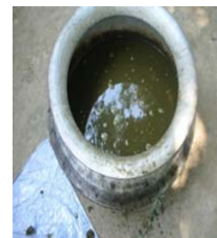
Figure 5. Activities of FPR on botanical pesticide in the PV centre