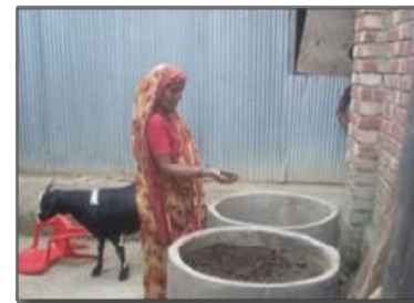
Figure 3. A woman is working in her vermin-compost pit

The members of the centre selected three crops: eggplant and two leafy vegetables (red amaranth and Indian spinach) for crop and seed production in the homestead, a food production unit within women's domain of work. Then the members of PV centre have decided to produce organic manure using vermi-composting. The method of composting has been introduced to Bangladeshi farmers recently by several Non Governmental Organization (NGOs). The process involves composting of cow dung, kitchen waste, and farm litter using various species of worms, usually red wigglers, white worms, and earthworms to produce heterogeneous mixture of manure. The project continues to support this activity and started FPR on composting since its inception in 2010 (Figure 3).